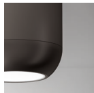
NI Matt nickel